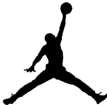
Nike's Jumpman logo