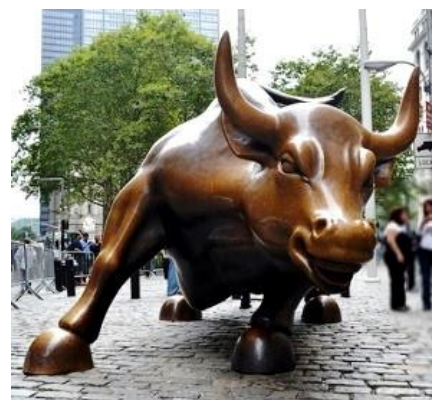
Image by Sebastian Alvarez. Licensed under the Creative Commons Attribution-ShareAlike 4.0 License

Charging Bull is a bronze statue created by sculptor Arturo Di Modica. The oversize sculpture depicts a bull, the symbol of aggressive financial optimism and prosperity, leaning back on its haunches and with its head lowered as if ready to charge. Now considered an iconic image of New York, Charging Bull was placed in front of the New York Stock Exchange (NYSE) on December 15, 1989, without a permit from the city of New York. NYSE officials called police later that day, and the NYPD seized the sculpture and placed it into an impound lot. The ensuing public outcry led the New York City Department of Parks and Recreation to reinstall Charging Bull two blocks south of the original location. The city extended a temporary permit for the sculpture and it has remained there.