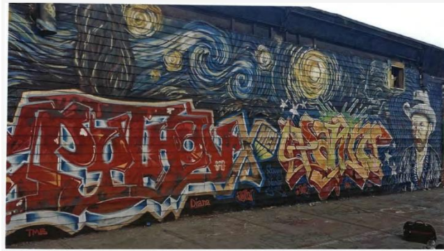
Kenji Takabayashi - Starry Night