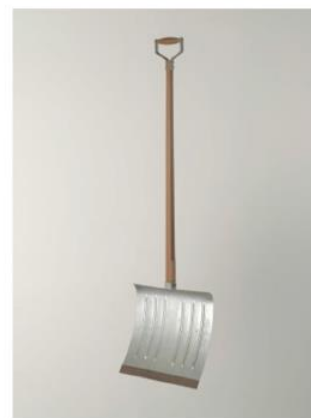
Fig. 4: Marcel Duchamp, “In Advance of the Broken Arm”