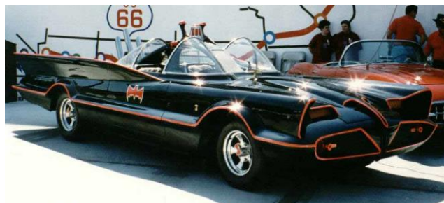
The Original Batmobile