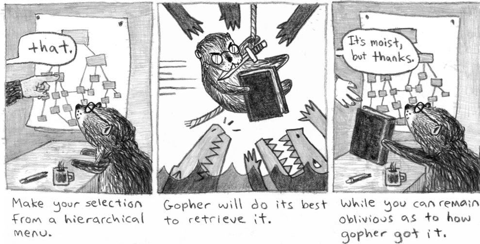
Figure 4. Cartoon strip from 1995 showing basics of Gopher information retrieval. File-menu design is depicted on paper tacked to wall. Information selected for retrieval is represented in the cartoon as a bound library book.

Because of these features, Gopher had some of the same problems as the Web. Users of both Gopher and Mosaic, for instance, were prone to feeling “lost in space,” especially when trying to recover particular information in a poorly remembered corner of cyberspace. 113 Both were subject to broken links—links to pages that no longer existed or had been moved. And both Gopher and the Web—products of an infinite number of individual decisions—had no formal mechanisms for propagating “mirrors” of popular information closer to home to better distribute the load. Again, the decision to abandon Gopher in favor of the Web was as emotional as it was rational. It was like an argument for metaphysics, impossible ultimately to prove or deny.