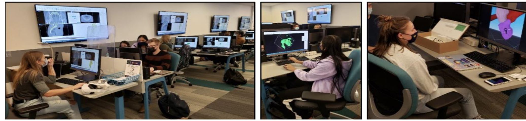
XR Module Day 1: Tutorial on digital segmentation of clinical CT and MRI images. Each student team then discussed their segmented image with surgical residents