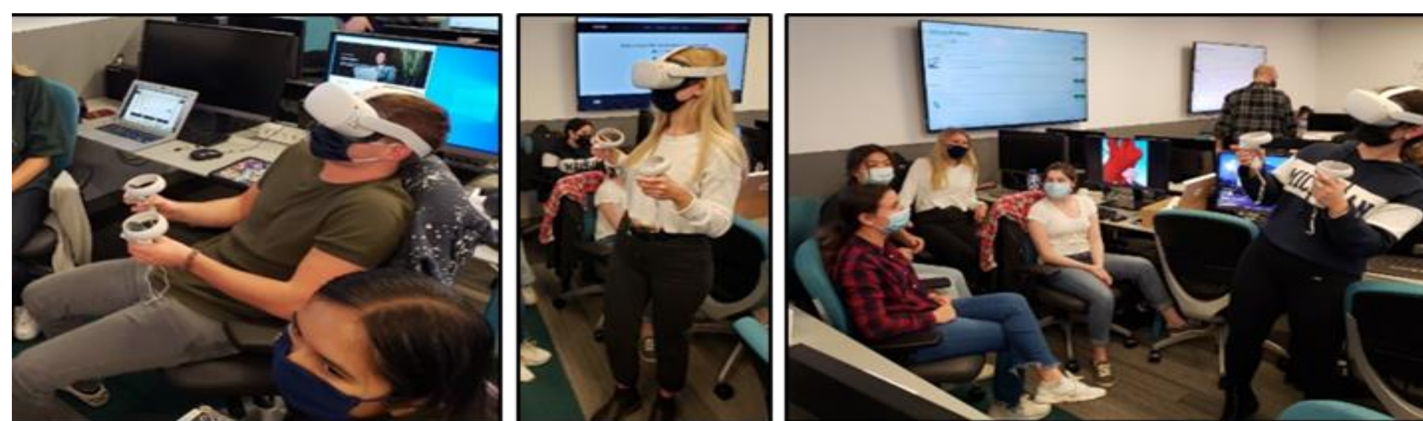
XR Module Day 2: Introduction to the Virtual Reality environment using Oculus Quest 2 headsets. The segmented CT and MRI images from Day 1 were then imported in the VR world for students to interact with surgical residents, course instructors, and each other.

The first iteration of this XR Module was successfully run in Fall 2021. Students worked on teams outside of class to prepare their VR project, and presented during the final showcase. Student teams demonstrated the ability to manipulate and discuss segmented digital models of human tissues in a virtual reality environment. All students completed both a pre-module survey covering their previous experience with XR and interprofessional interactions, as well as a post-module reflection form that re-assessed the pre-module questions and also allowed students to provide feedback on their experience with the module. Preliminary analysis of the pre- and post-module feedback demonstrated that the XR module increased the comfort level of students in using VR, and also increased their comfort in using VR to interact with clinicians (see Figures). Overall, the module was successful and impactful, though we identified several technical and logistical challenges in the first iteration.