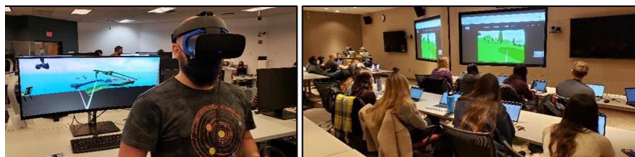
XR Module Day 3: The VR Module Showcase allowed student teams to show and discuss their segmented CT and MRI models with the class. The project PIs and surgical residents also attended remotely, using their own VR headsets to enter the virtual environment.