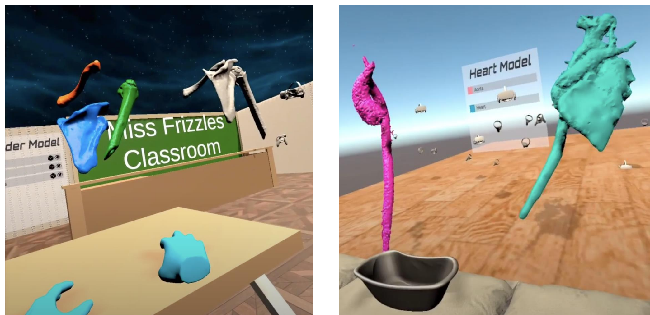
XR Module Day 2: Segmented student datasets in VR environments.